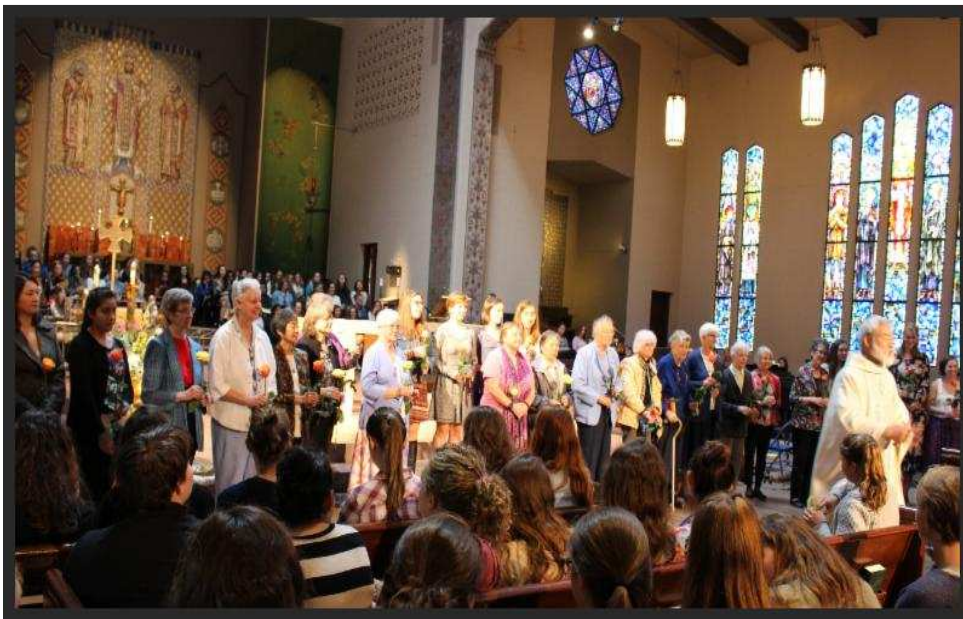
Mass on October 6 at St. Joseph Church in Seattle.

During Mass on October 6 at St. Joseph Church in Seattle, Sisters, Holy Names Academy, Seattle volunteers in Jonestown and Holy Names Academy, Seattle students who attended the SNJM Youth Justice Forum were recognized for their service inspired by Mother Marie Rose. After Mass, the Sisters met with the students during lunch to hear more about their experiences learning about the SNJM charism. See below for a photo.