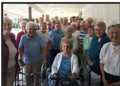
South Bay Mission Centre Café Conversation participants.