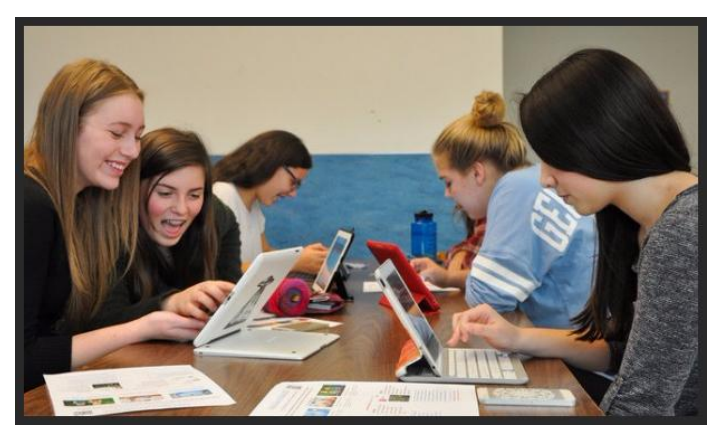
St. Mary's Academy students.

Read more at: <u>http://blog.oregonlive.com/my-</u> portland/2015/12/we need to end the era of brog.html