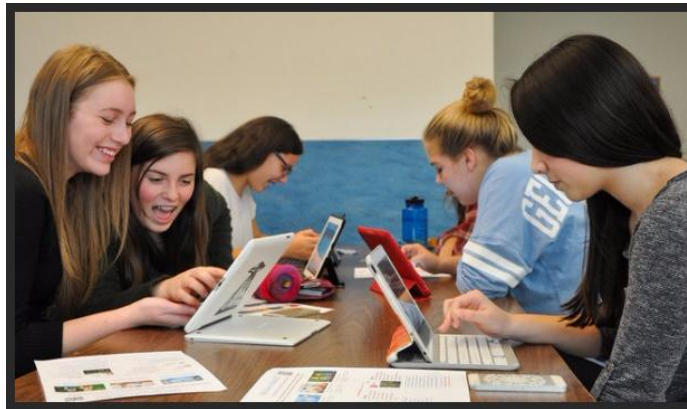
St. Mary's Academy students.

Read more at: http://blog.oregonlive.com/my-portland/2015/12/we-need-to-end-the-era-of-brog.html