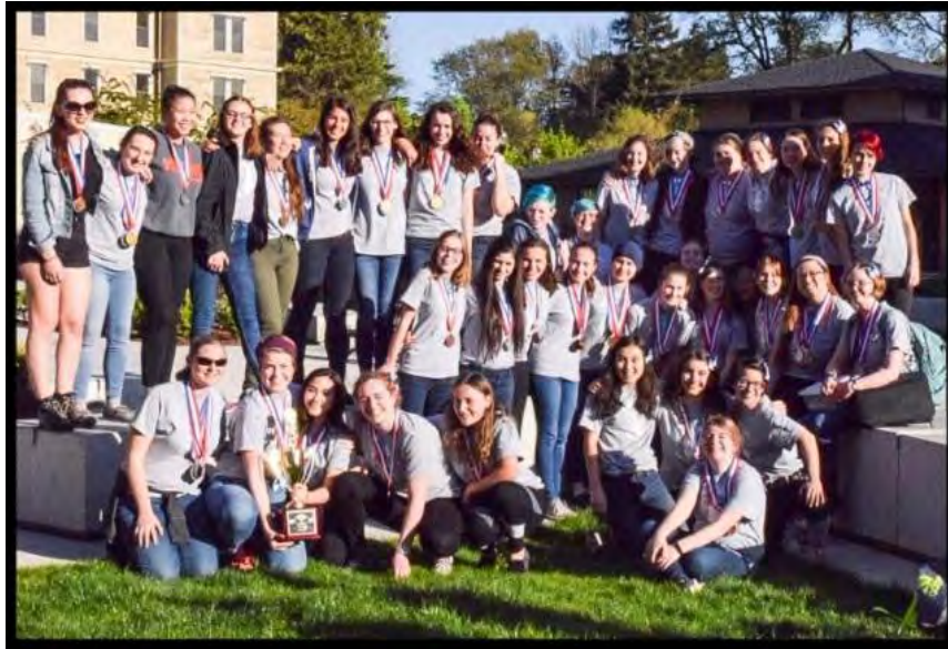
SMA Science Olympiad team.

http://www.stmaryspdx.org/cms/One.aspx?portalId=1524057&pageId=26709428