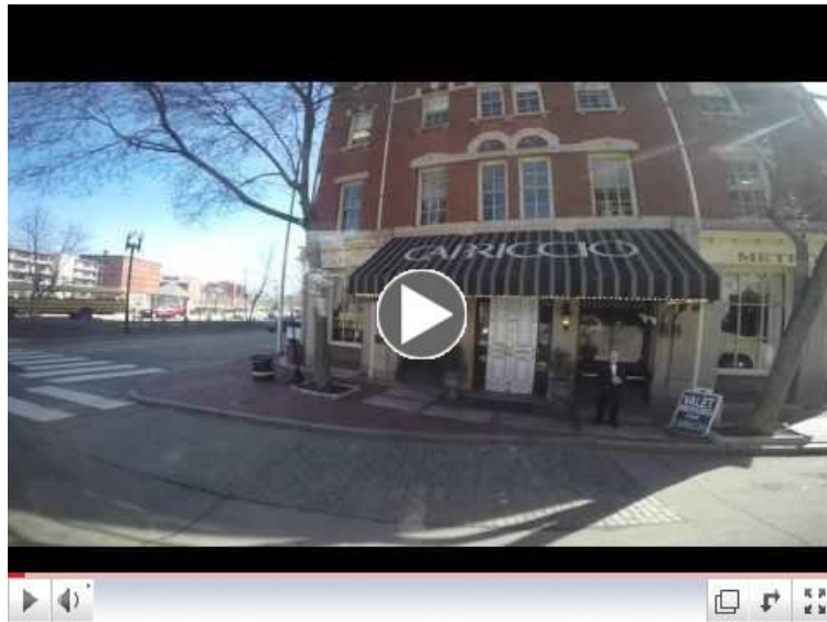
First Place Video, IPJC Just Video Contest.

over 40 video entries. SNJM schools won every award. You can watch the first place video from Ramona Convent Secondary School on human trafficking at: https://youtu.be/uLeWNghG7Io or by clicking the video link below. Read more about the contest and watch all the winning videos at: http://www.ipjc.org/programs/justvideo_winners.html