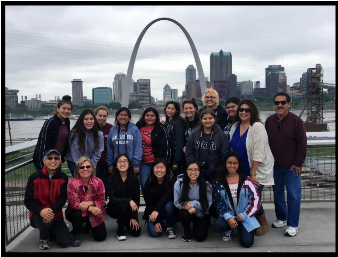
Ramona Rampage robotics team in St. Louis.