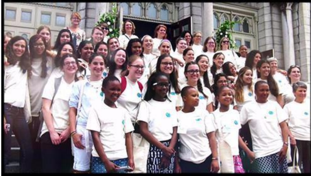
This picture of students and their volunteer leaders at the 2015 Youth Justice Forum appears in the new video.