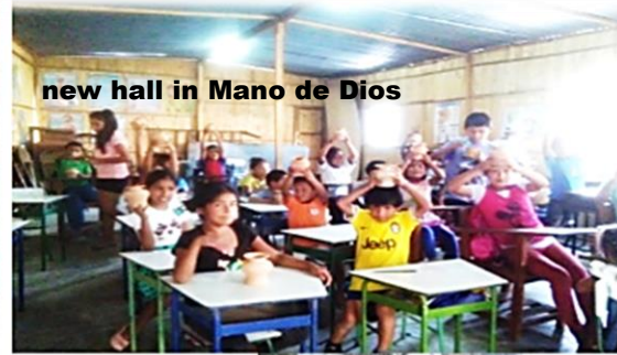
new hall in Mano de Dios