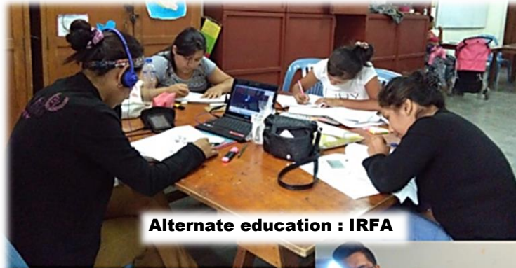
Alternate education : IRFA