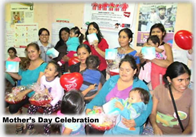
Mother's Day Celebration

In March of 2016, committed to the passion of the Missions Sector, I took my final vows, giving myself to God. My journey as an SNJM Sister offers me many opportunities in life to continue serving the people of God and, together with them, to take on new challenges.