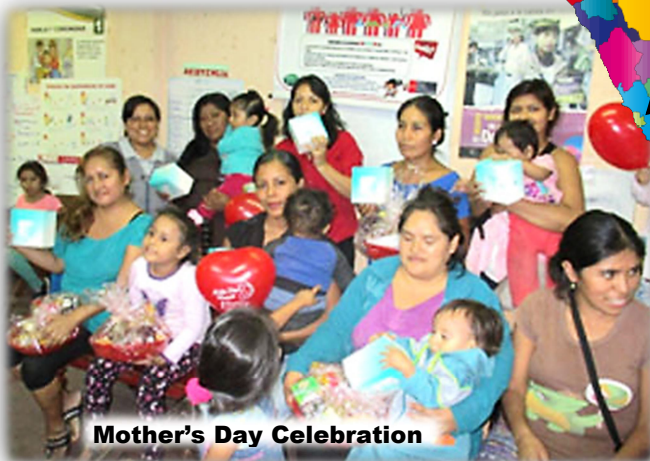
Mother's Day Celebration

In March of 2016, committed to the passion of the Missions Sector, I took my final vows, giving myself to God. My journey as an SNJM Sister offers me many opportunities in life to continue serving the people of God and, together with them, to take on new challenges.