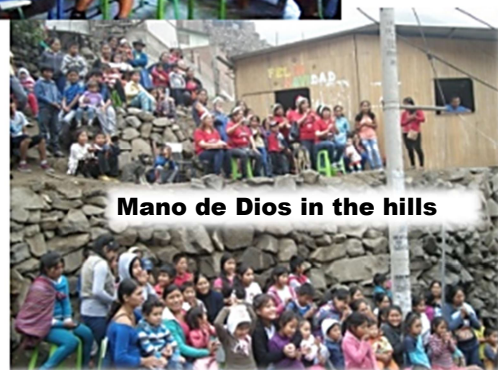
Mano de Dios in the hills