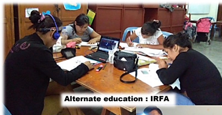
Alternate education : IRFA