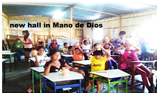
new hall in Mano de Dios