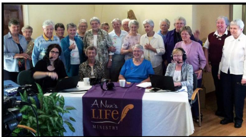
Group of Sisters gathered to hear the live podcast.