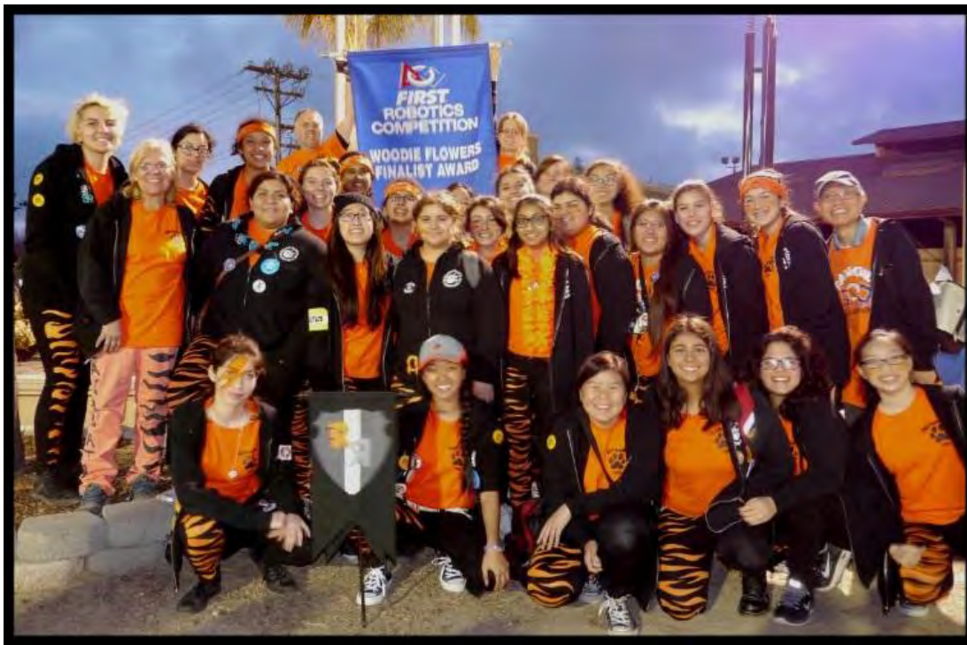
Ramona Rampage, the robotics team at Ramona Convent Secondary School.

http://q13fox.com/2016/03/08/washingtons-only-all-girls-robotics-team-competes-for-title/